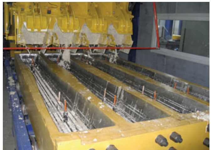
Simultaneously to the concreting process the compaction takes place by using a high frequency compaction station