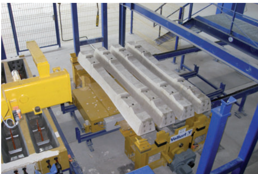
Concrete sleepers before final assembly