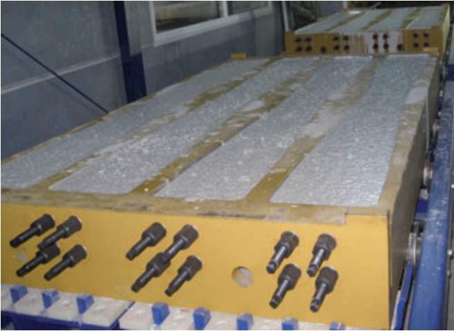
Sleeper form after concreting