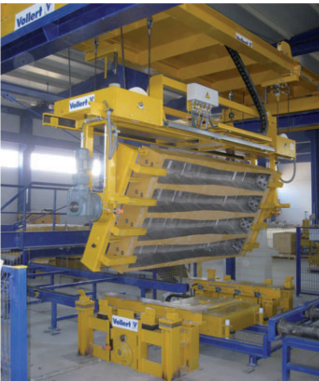
The forms are demoulded by using a turning device