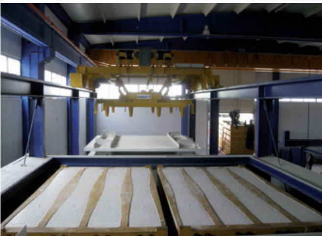
Manipulator for storage of the forms in the curing chamber