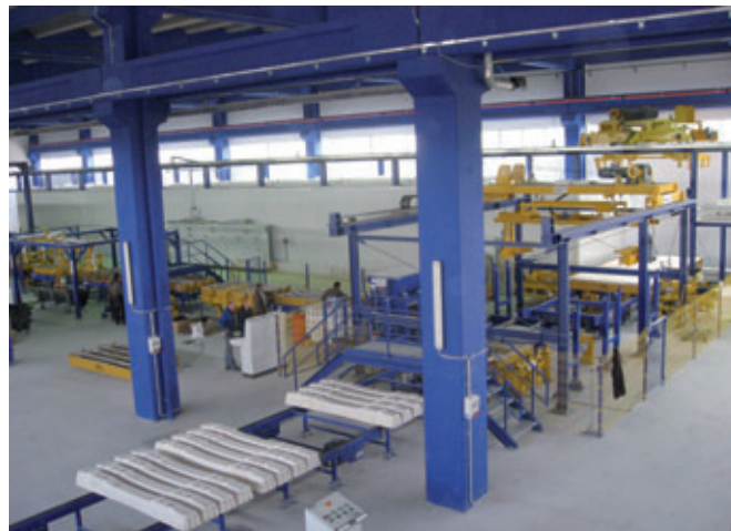
The sleepers are handed over to the final assembly