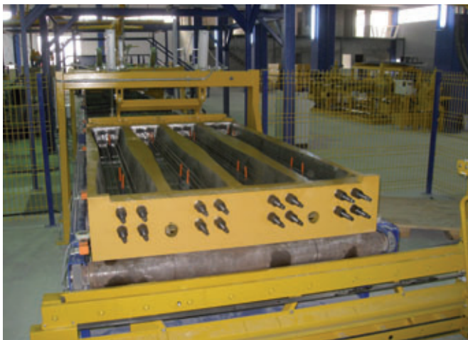
Sleeper form after bringing in the reinforcement

The plant was finished in March 2010 and has been tailored to fit exactly the environmental conditions. The mould circuit has a ground area of only 65 x 25 meters resulting from a very compact installation structure. 450.000 pre-stressed concrete sleepers will be produced prospectively in a 2-shift operation, with a production of 80 sleepers per hour. In order to achieve this number of units, an intelligent planning of every individual production process was necessary.