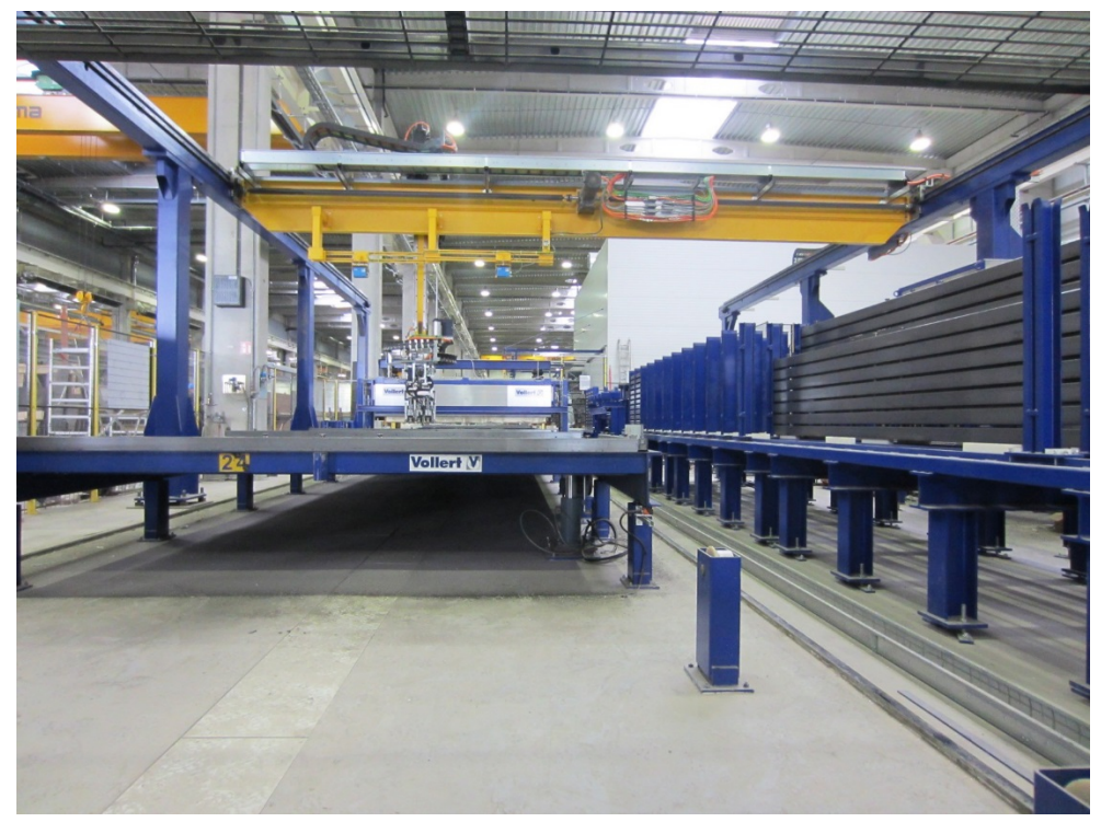
Fig.2: A SMART SET<sup>2</sup> shuttering robot places the RATEC shuttering profiles precisely onto the prepared circulating pallet at high movement speeds