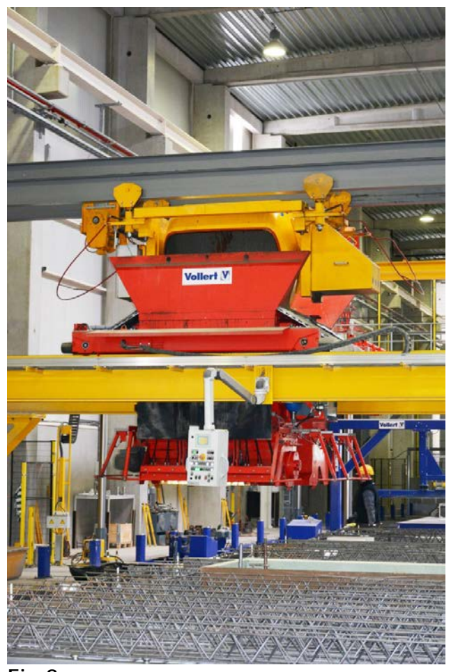
Fig.3: Supplied via a turning-bucket conveyor, a SMART CAST automatic concrete distributor ensures homogeneous and precise output of the concrete