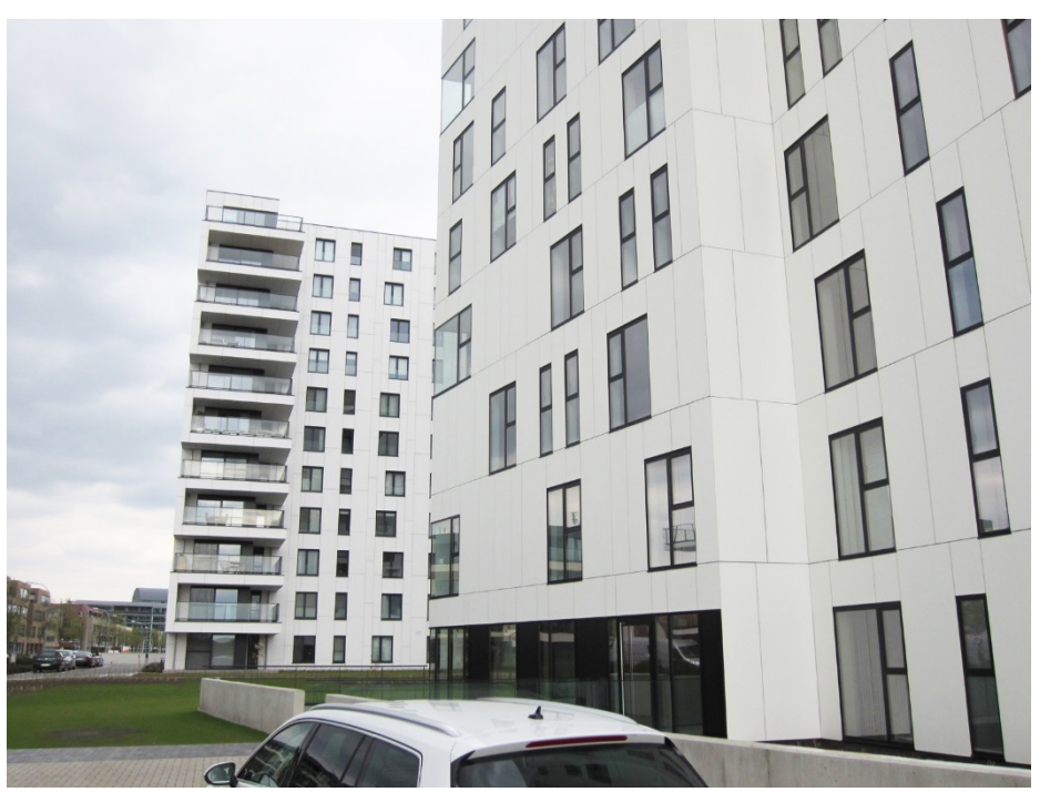
Fig. 9: The modern, attractive architecture is a special characteristic of all projects of the Cordeel Group