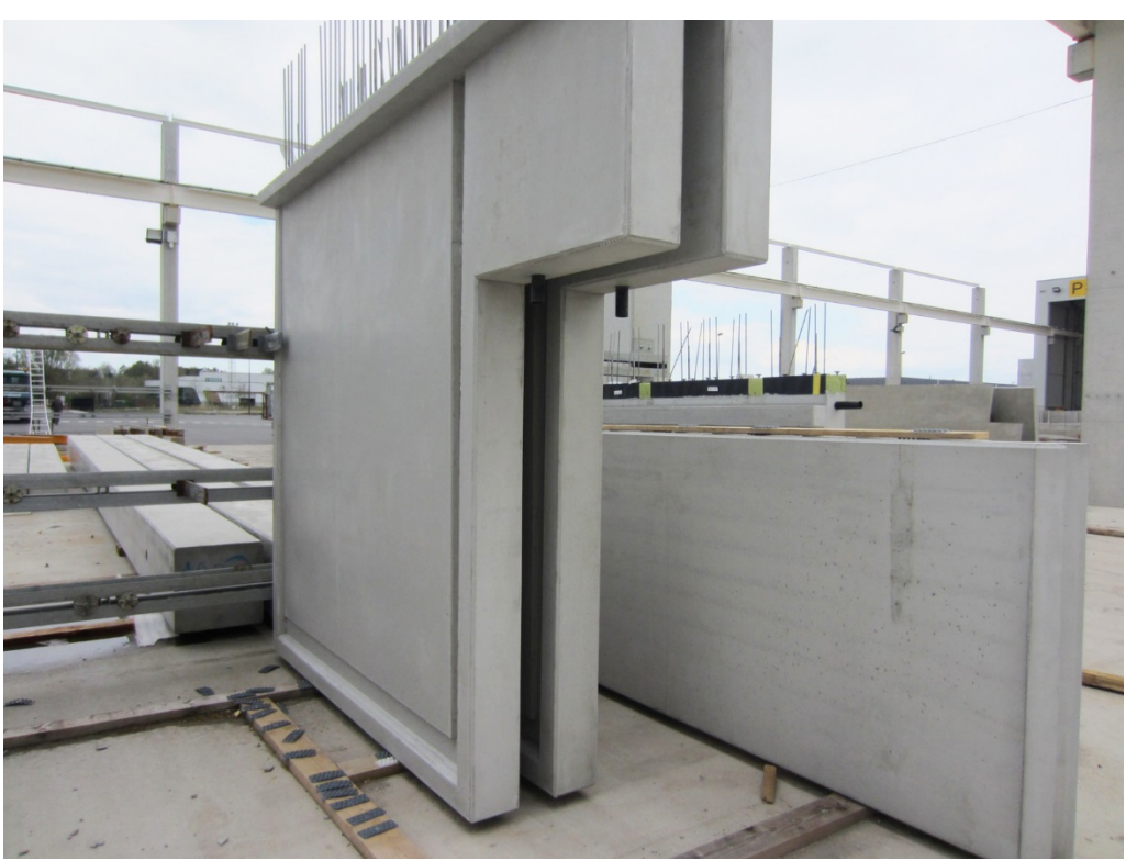
Fig. 8: For the modern architecture in precast concrete construction Cordeel uses solid, double and sandwich concrete parts