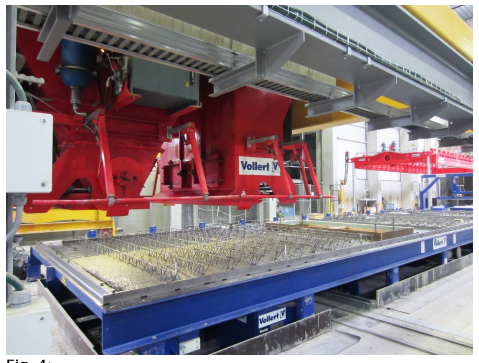
Fig. 4: The twin concrete bucket is a true novelty as well. This way, not only normal concrete can be applied but also coloured exposed concrete.