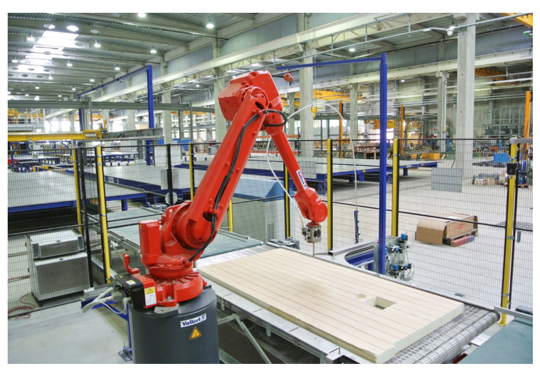
Fig. 6: For the production of sandwich concrete parts the new Cordeel factory relies on the ISO-MATIC 2.0, which permits highly precise and fully automated preparation of insulation