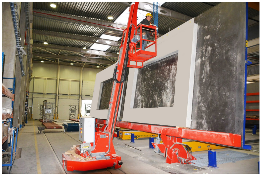
Fig. 7: The solid concrete and semi-finished parts are vertically lifted off by a VArio TILT high-performance tilting station