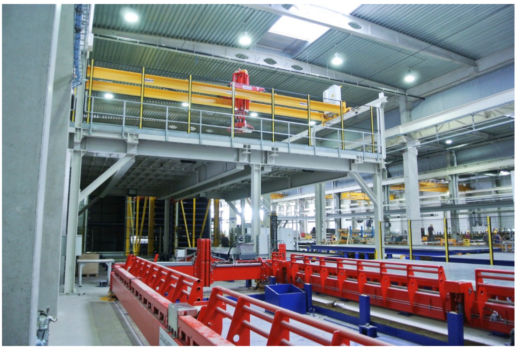
Fig. 5: For high quality of the exposed concrete of the solid concrete parts, these parts are transported onwards to a smoothing station on a 2^{nd} level